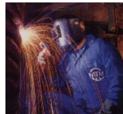
Welding courses will be available