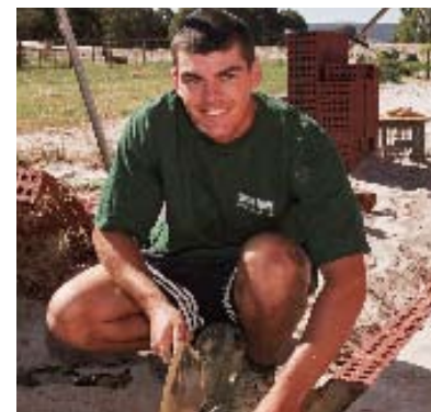
Building trades are in big demand.

As a response to a high youth unemployment problem the College will provide opportunities for hundreds of young people each year to gain pre-apprenticeship skills and training in the construction, automotive and metal industries. Special emphasis will also be given to developing business skills.